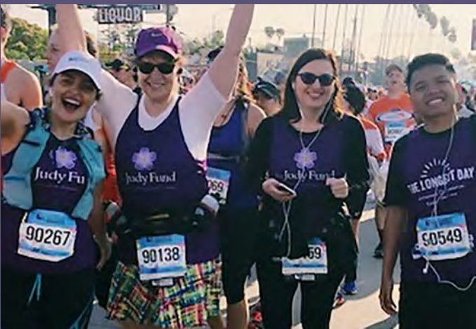
The Judy Fund team participating in the Los Angeles Marathon for The Longest Day.