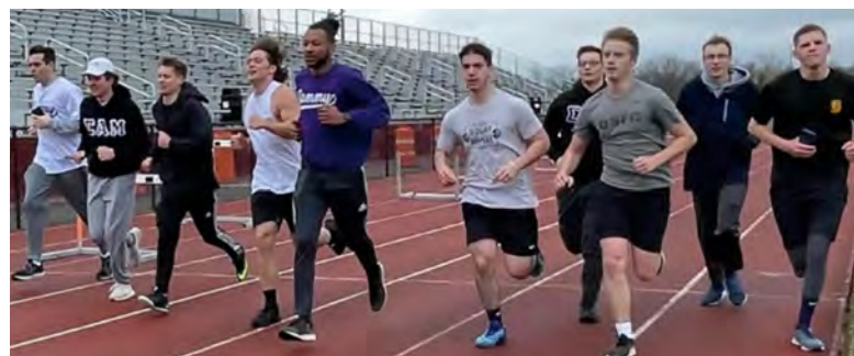
Delta Omega Chapter at Rochester Institute of Technology hosted their second annual “Run for the Fund” event, raising nearly $1,200 for The Judy Fund. The chapter livestreamed the event over social media to reach more supporters.

Sigma Alpha Mu fraternity (“Sammys”) has steadfastly supported The Judy Fund since 2005, raising nearly $1 million to advance the fight against Alzheimer’s. With 25 of their 40 active chapters participating in fundraising and awareness efforts this year — including the Alzheimer’s Association Walk to End Alzheimer’s® and The Longest Day®, and their own “No Shave November” competition — the Sammys continue to raise the philanthropic bar in collegiate and alumni circles.