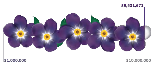
Progress toward The Judy Fund goal of $10 million.

With your help, The Judy Fund has teed up a courageous goal: We will pass the $10 million milestone. We are a stone's throw from raising and granting $10 million — directly funding Alzheimer's research, combined with funding strategic public policy efforts to drive government research. Our collective investment results have paid off — by supporting the Alzheimer's Association Ambassador Program, strategic advocacy has resulted in a sevenfold increase in federal National Institute of Health (NIH) funding — from $504 million in 2013 to $3.55 billion in 2022.