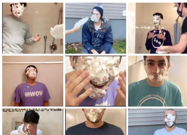
The Epsilon Nu Chapter at the University of Connecticut hosted a “Pie-a-Sammy” event to support The Judy Fund and Alzheimer’s Association.