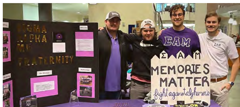
The Epsilon Alpha Chapter at Stephen F. Austin University participated in an on-campus showcase, raising awareness and funds for The Judy Fund.