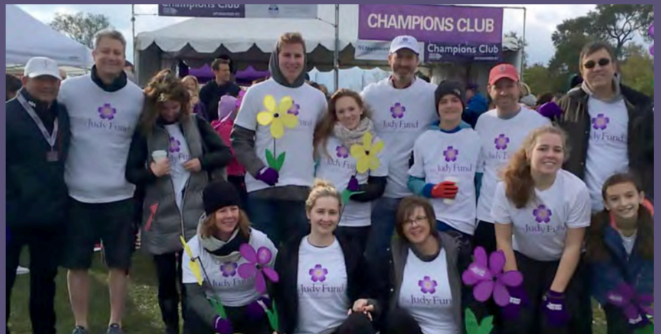
The Judy Fund team at Walk to End Alzheimer's in Chicago.