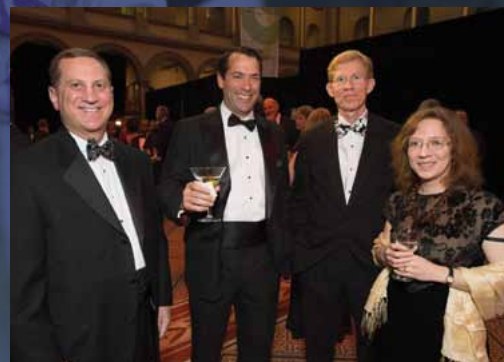
The 2009 National Alzheimer's Gala