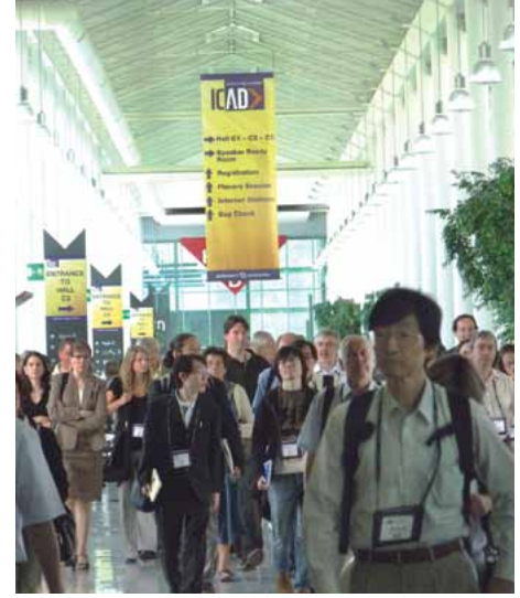
Nearly 3,800 attendees traveled to Vienna for ICAD 2009.