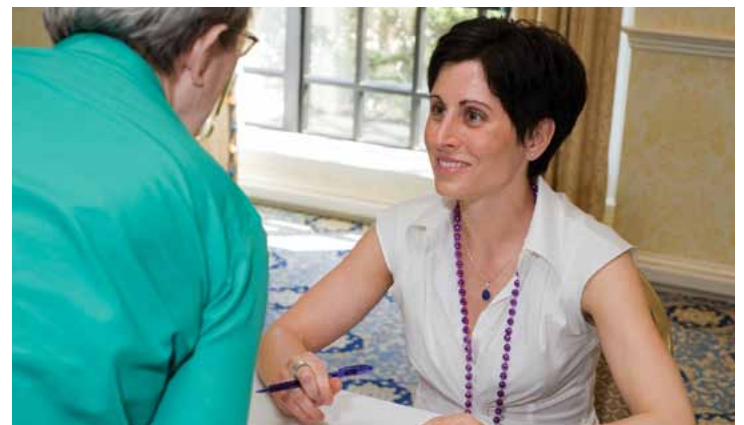
Author Lisa Genova signs copies of her Alzheimer-focused novel Still Alice.