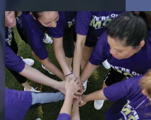
2008 Memory Walk participants