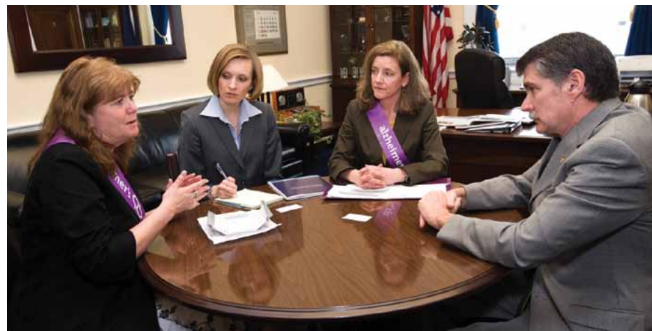
Alzheimer advocates meet with congressional representatives on Capitol Hill.