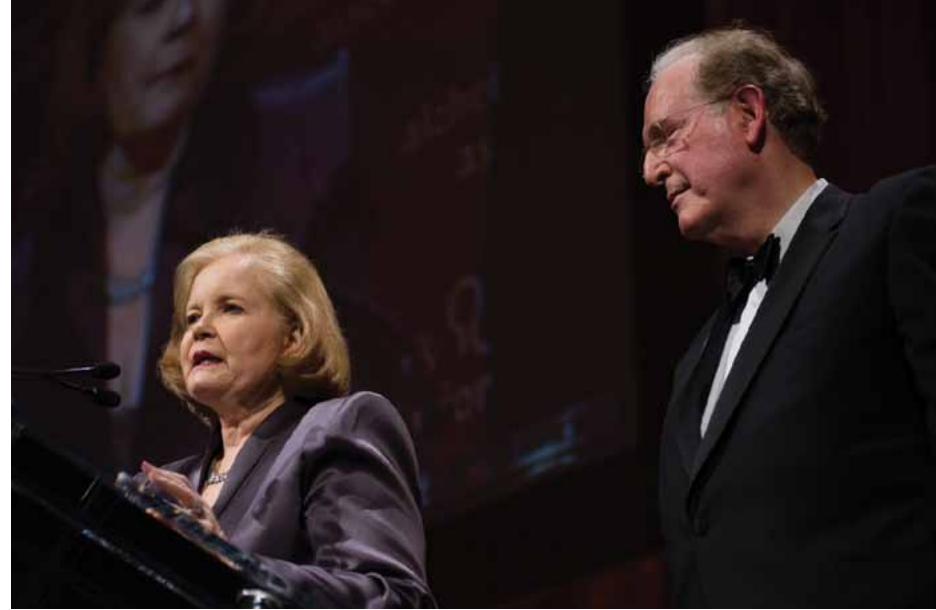
Sharon Percy Rockefeller and Jay Rockefeller address the audience after receiving the Sargent and Eunice Shriver Caregiver Dignity Award.

As a conclusion to the Public Policy Week, many of our country's philanthropic, corporate, social and political leaders came together for a night of celebration and recognition. On March 25, these noted supporters gathered at the 6th annual National Alzheimer's Gala. Held at the National Building Museum, the gala is one of Washington's most prominent events, attracting more than 750 people each year to build awareness of Alzheimer's as a national priority.