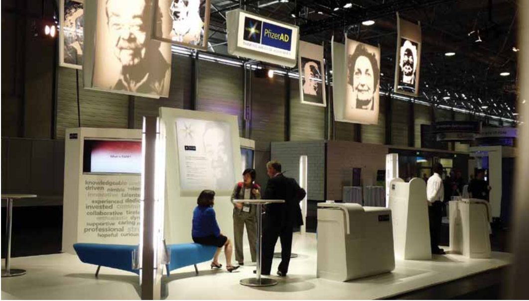
Exhibitors and attendees gathered daily in the Exhibit Hall to share information and ideas.