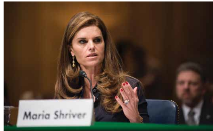
First Lady of California Maria Shriver testifies before the Senate Special Committee on Aging.