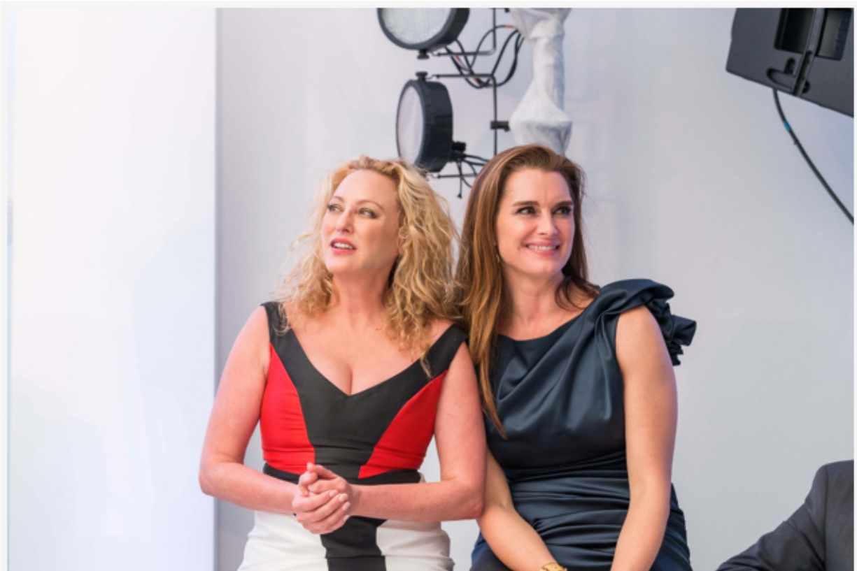
Virginia Madsen and Brooke Shields