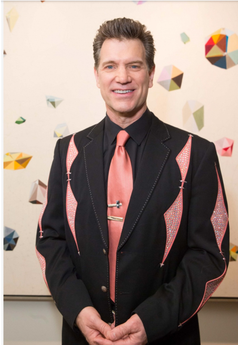
Chris Isaak