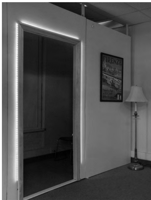
Figure 2. Amber LED lights to outline the bathroom door.