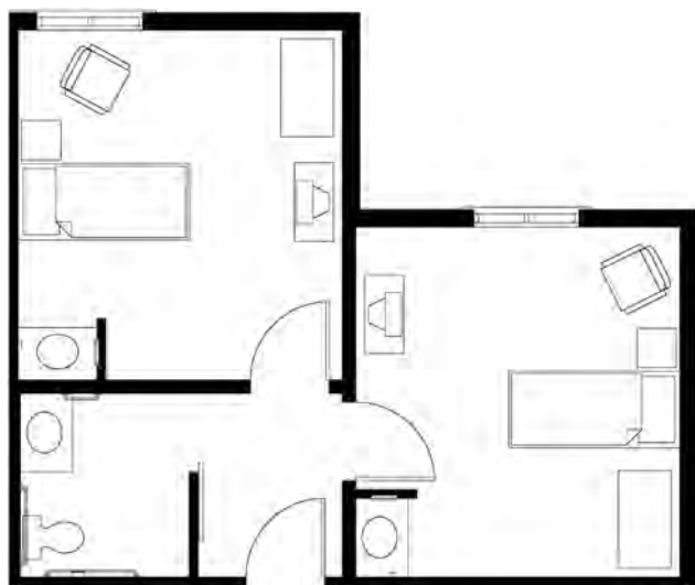
Figure 1. Enhanced shared-bedroom. Credit: Gaius Nelson, Nelson Tremain Partnership, P.A.

visually from its neighbors. An open floor plan not only makes it easier for the individual living with dementia to find a destination but also makes it easier for the care partners to see where the person is. This same principal of visual cues is also applied in shared residential settings where often bedroom or apartment entrances have a case or shelf for residents to display personal mementoes. There is some research that suggests that it is the meaningfulness of the items that is most critical in having these display areas be effective (Namazi, 1990; Namazi, Rosner, & Rechlin, 1991; Nolan, Mathews, Truesdell-Todd, & VanDorp, 2002; Gibson, MacLean, Borrie, & Geiger, 2004). Other researchers have found that buildings or living areas with simple plans that have few required changes in direction or open plans, support better orientation (Marquardt & Schmieg, 2009; Brush & Calkins, 2008). There is also strong evidence, albeit from only one study, that direct visibility of the desired destination may have a profound impact on successful destination finding: a study from the Corinne Dolan Center found an eightfold increase (from 37 to 285) in use of the toilet when it was directly visible (not behind a door or curtain and in high contrast with the surrounding walls and floor; Namazi & Johnson, 1991). Color, in and of itself, has not been shown to be an effective wayfinding cue (Cooper, Mohide, & Gilbert, 1989).