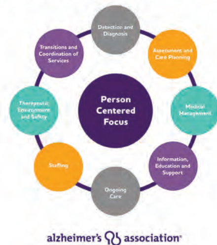
Figure 1. Dementia Care Practice Recommendations.

This article highlights the recommendations from all 10 articles in the Supplement Issue of The Gerontologist entitled, Alzheimer's Association Dementia Care Practice Recommendations . Each article provides more detail about the specific recommendations, as well as the evidence and expert opinion supporting them. This supplement includes two areas that generally are not included in recommendations for providers in community and residential care settings, although these topics are frequently included in recommendations for physicians and other medical care providers—detection and diagnosis and ongoing medical management. Different from existing recommendations on these two topics, the articles are written for nonphysician care providers and address what these providers can do to help with these important aspects of holistic, person-centered dementia care. Throughout all of the articles, Alzheimer's disease and dementia are used interchangeably. Care partner is used to refer to those people supporting individuals in the early stages of dementia, and caregivers is used to refer to those supporting individuals in the middle and late stages; care provider is used for paid professionals. Lastly, the closing article by Thornhill and Conant (2018) outlines the interplay of policy and practice rounds out the supplement.