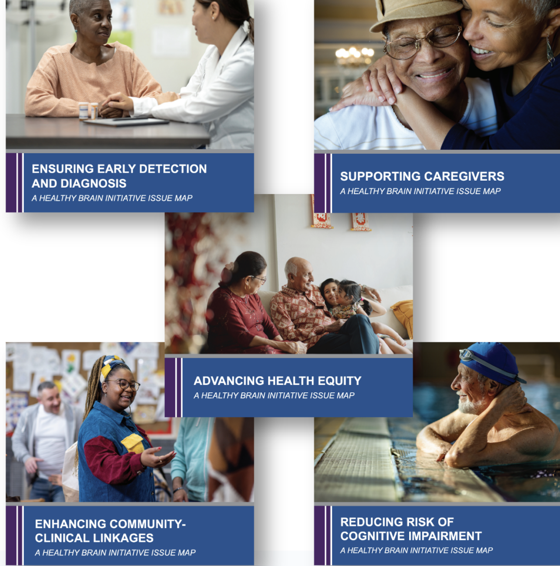
ENSURING EARLY DETECTION AND DIAGNOSIS A HEALTHY BRAIN INITIATIVE ISSUE MAP

Establish a public health approach to dementia caregiving that effectively supports and meets the needs of those caring for people with dementia.