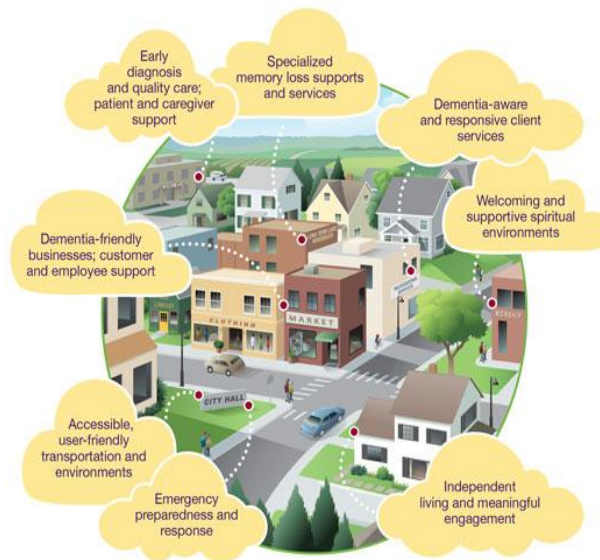
Figure 3.2: ACT on Alzheimer’s Dementia-Friendly Community Resources 25